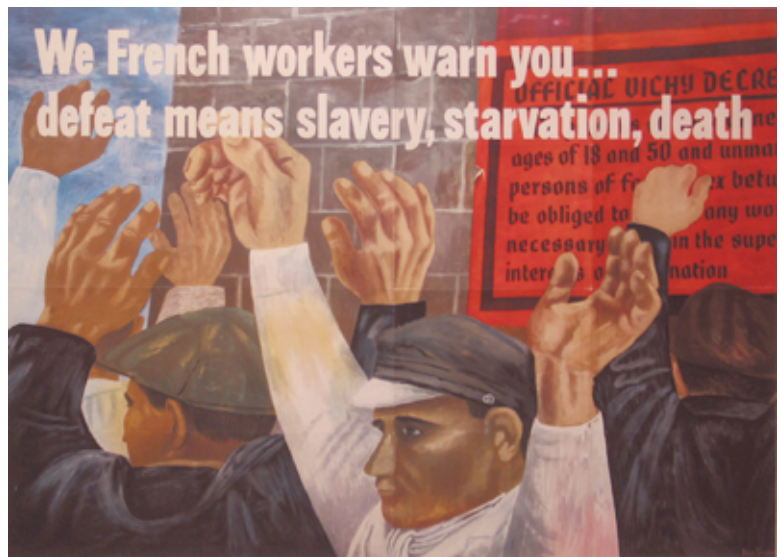
Above: Ben Shahn, We French Workers Warn You , 1942, Private Collection